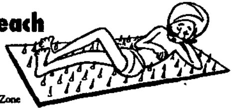
Bed Tacks? No Problem!

Published Weekly by: The Downtown Fun Zone 832 Highway 101, Box 49 Port Orford, OR 97465 (503) 332-6565 (Voice or FAX)