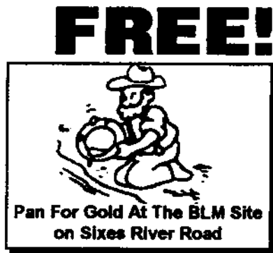
Pan For Gold At The BLM Site on Sixes River Road