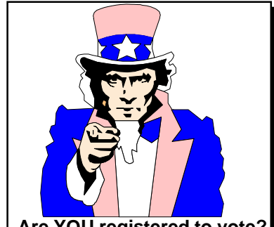
Are YOU registered to vote? Deadline is Tue., Oct. 17