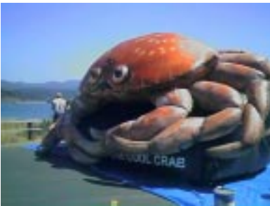
One Cool Crab

The albacore tuna barbecue at the dock on Sunday was a smash success. The Port Orford Women's Fishery Network, Port Orford Fishermen's Association and Arts Council barbecued 150 pounds of tuna and by 2:30pm it was sold out. That came out to about 300 meals served. People relaxed and ate while listening to Port Orford's own Antique Dog play a collection of blues and original rock'n'roll. One of the biggest hits down at the boneyard at the dock was the huge inflatable crab known as "One Cool Crab".