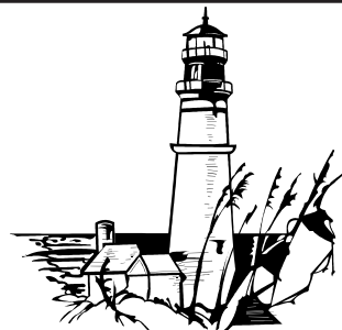
Cape Blanco Lighthouse Reopens!