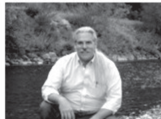
Proprietor of Java John's Espresso