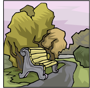
A Day in the Parks